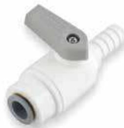
Polypropylene Ball Valve