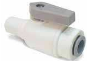
LIQUIfit™ Ball Valve