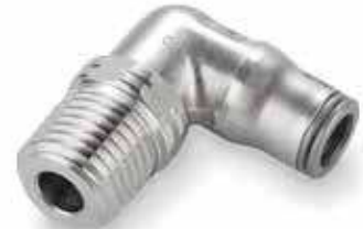
Prestolok® PLS Stainless Steel