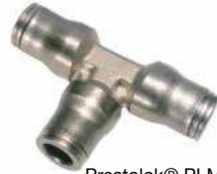
Prestolok® PLM Electroless Nickel Plated

Silicone Free push-to-connect fitting with FKM seal offering excellent resistance to aggressive wash-down environments. The smooth surface design reduces retention zones for safe and easy cleaning. Available in NPT, BSPT, BSPP and Metric threads.